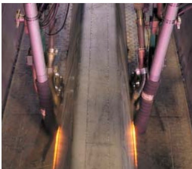
Modules are robotically welded to meet the highest quality standards.

The result is the same high quality for every scale, every time.