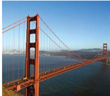
Our scales have the same orthotropic design used for the Golden Gate Bridge and many other high-traffic roadway bridges.

When a highway bridge fails, the results can be catastrophic. Many bridge designers are now turning to orthotropic ribs as a better alternative to conventional I-beam structures because of the proven strength, reliability, and longevity. They know that the strength and durability of a weighbridge has more to do with how the steel is used than with how much steel is used. Don't let a failed weighbridge be catastrophic for your business.