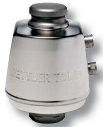
POWERCELL PDX Load Cell

Upgrade your scale to POWERCELL® PDX® technology and experience the ultimate in reliability. POWERCELL PDX load cells eliminate the need for maintenance-prone junction boxes, totalizers, and sectional controllers.