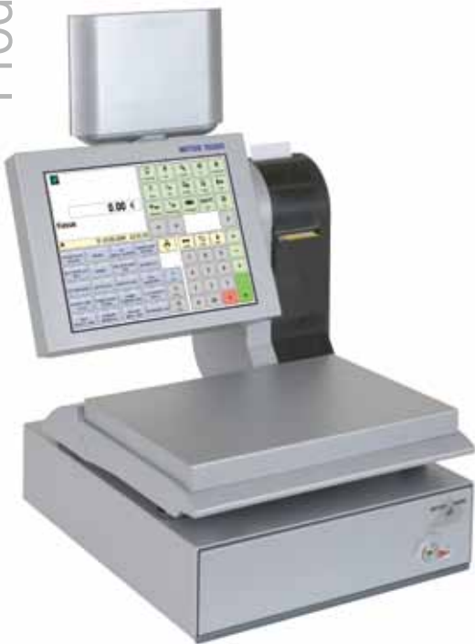
UC3-RTT-A Terminal with optional cash register drawer

Looking for a weighing platform or cash register software? Not here. And yet the UC3-RTT-A is still a genuine all-rounder. So is it a cash register or set of scales? Well actually, it is both!