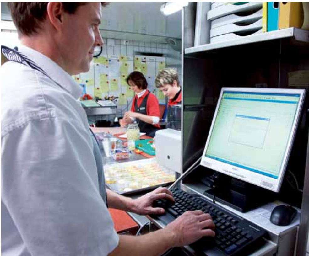
Seamless integration: at the "Metzgerei Fischli" butcher's store, master data maintenance and materials management both run on Swiss vertical market software, while METTLER TOLEDO cash register software is used for cashing up. Data transfer between the two systems works perfectly, which saves both time and unnecessary duplicate entries.

Freshness, cleanliness and hygiene are the most important criteria when selling fresh meat and cold cuts. The quality of fresh products, attractive presentation of the products and keeping the sales area immaculate – these are the key criteria customers look at when selecting their butcher. Robustness and hygiene go hand in hand on the UC3-Line scales from METTLER TOLEDO. Indeed, all scales in the UC3-Line are trimmed for functionality and simple cleaning, comply with high IP degrees of protection, and are resistant to dust and water. The metal housings are resistant to salts and fatty acids, as well as cleaning solutions and disinfectants. The data interfaces are angled downward, which protects them from accidental exposure to moisture. The chromium steel weighing cell is hermetically sealed to protect it from all external influences.