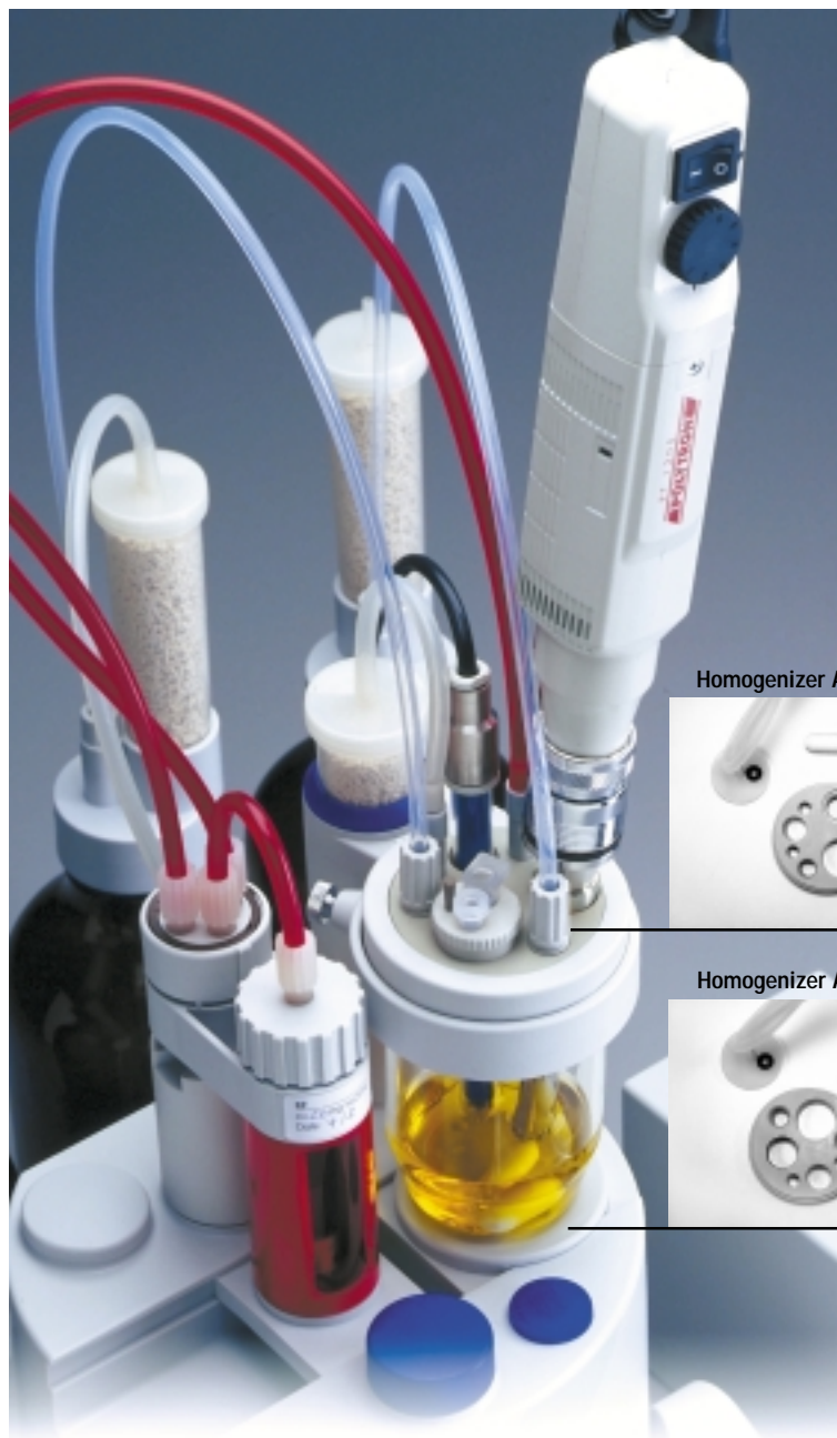
Homogenizer Adapter Set 12